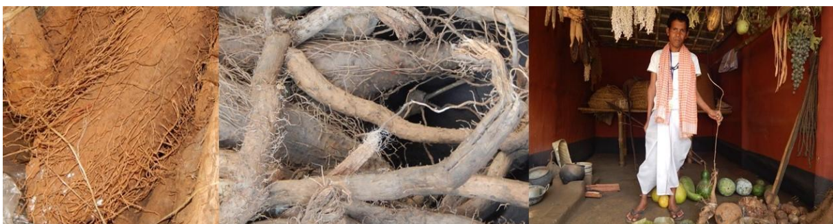
Fig. 2 Stored tubers of Dioscorea hispida along with other wild medicinal foods