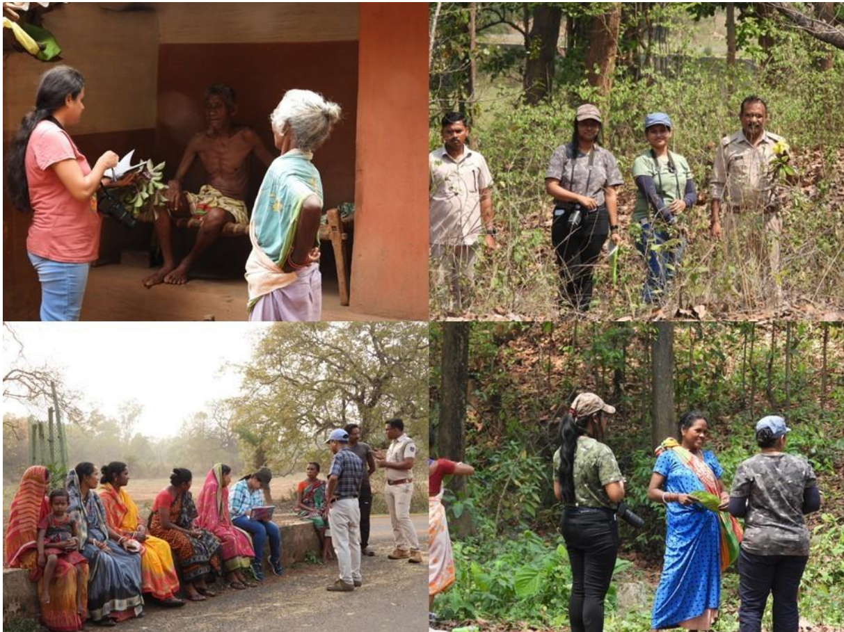
Fig. 1 Discussion with local communities of India and forest officials about the uses of Dioscorea hispida

cultures from nutrient broth were inoculated in the different serial dilutions of the plant extracts and incubated at 35 \pm 2^\circ\text{C} for 18–24 h. Kanamycin and Ampicilin served as standard antibiotics control. After 24 hours incubation, clear tube among the inoculated serial dilution was taken as a MIC (Gonelimali et al., 2018; Balouiri et al., 2016; Kumar et al., 2013; Devi et al., 2023).