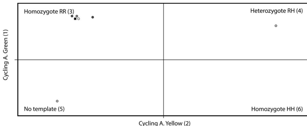
Figure 2 Representative results of scatter plot analysis of TaqMan assay

Obrázok 2 Reprezentatívne výsledky rozptylu TaqMan analýzou