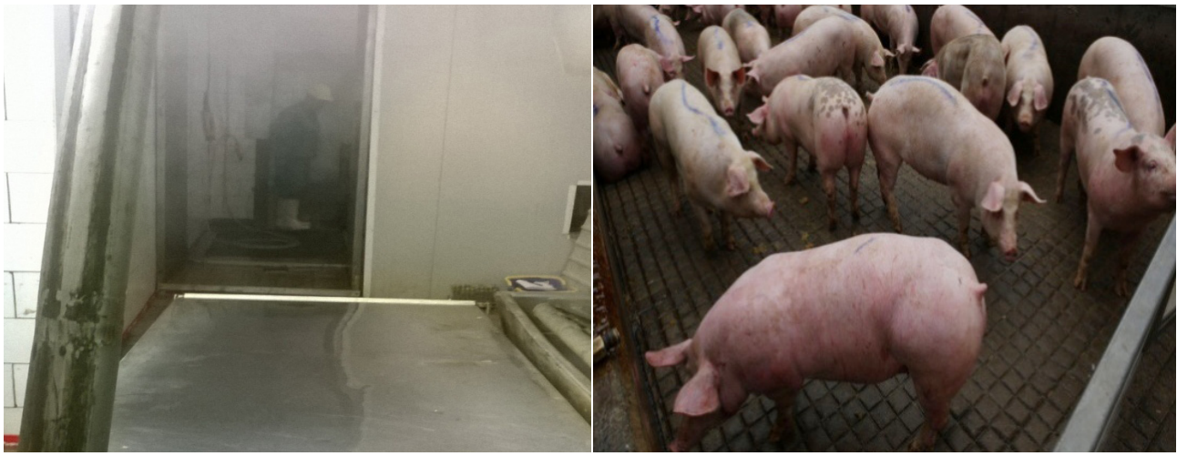
Figure 1View into the area for stunning and bleeding

The study was carried out in a small slaughterhouse situated in east of Slovakia (Figure 1). Evaluation of the sanitation was carried out by microbiological swabs. Disinfectant Virkon S, which was used for disinfection of surfaces, is a multipurpose disinfectant balanced, stabilized blend of peroxygen compounds, surfactant, organic acids, and inorganic buffer. It contains oxone (potassium peroxymonosulfate, used as an oxidizing agent), sodium dodecylbenzene sulfonate (anionic surfactant), sulfamic acid, and inorganic buffers. Virkon S is recommended for use as a hard surface disinfectant in livestock production and transportation facilities. Disinfectant was in liquid form, applicated by spraying in 1% of concentration without heating, exposure time was 60 minutes. Swabs were taken from monitored places before and during slaughtering and bleeding and after disinfection.